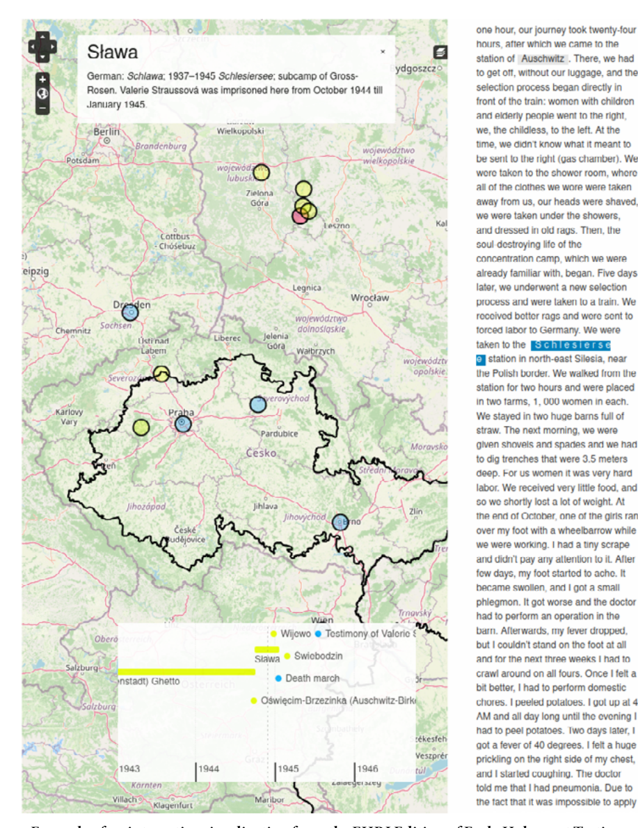
Example of an interactive visualization from the EHRI Edition of Early Holocaust Testimony projecting the text onto a map.

sources were rarely used and neglected. One of the main goals in this project was to make the materials more accessible not only to scholars, but also to students and the wider public. The edition therefore provides an English translation of each testimony alongside transcripts in the original languages, which include Hungarian, Polish, Czech, German, Dutch, and French. This is as an open-ended and ongoing project. At the time of this writing, the editorial team is working on a set of over thirty testimonies in Yiddish, which will later be included in the edition. Twenty testimonies are included from the Czech sources, which were mostly gathered within the so-called Dokumentační akce (Documentation Campaign). The content of these testimonies is usually very brief in character, structured as court testimonies that focus on facts and the identification of perpetrators.