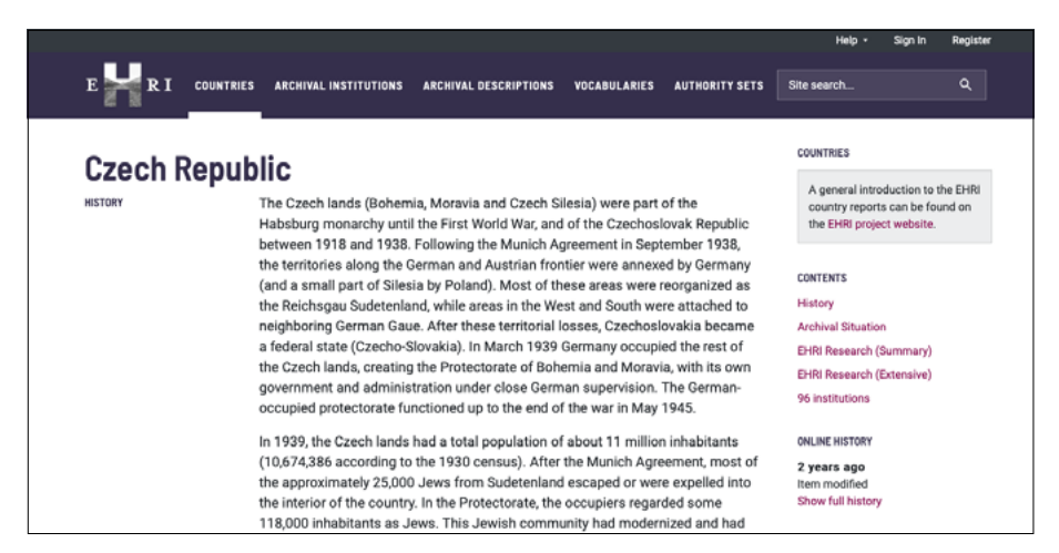
EHRI Portal, the country report for the Czech Republic.

The portal also includes a number of relevant descriptions and sources related to the Holocaust in the Bohemian lands. Users can use the country report for the Czech Republic as a starting point, which provides a short history of the Holocaust in the Protectorate of Bohemia and Moravia, a brief description of the local archival system, and an overview of the EHRI methodology of surveying in the country. Currently, 96 Czech archives holding Holocaust-related materials are listed, including city and state archives as well as non-governmental institutions.<sup>2</sup> To survey collections in regional and district archives, the Czech EHRI partnered with the Yerusha project, which focusses on collections related to Jewish history and shared expertise, contacts, and resources.<sup>3</sup>